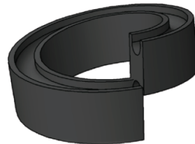
UNINSTALLED COIL SUMOSPRING