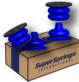
B SUMOSPRINGS REAR SSR-143-40-2