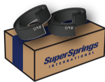
A COIL SUMOSPRINGS CSS-1195