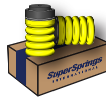
B SUMOSPRINGS REAR SSR-121-54