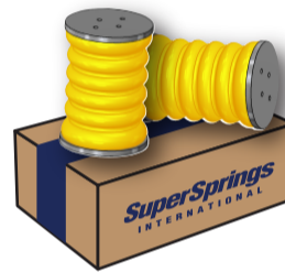
B SUMOSPRINGS REAR SSR-183-54-1