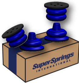
A SUMOSPRINGS FRONT SSF-173-40-2