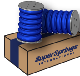
B SUMOSPRINGS REAR SSR-184-40-1