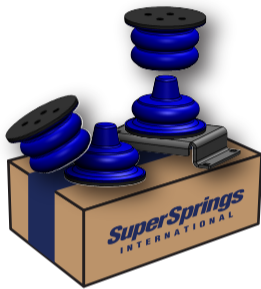
A SUMOSPRINGS FRONT SSF-170-40-2