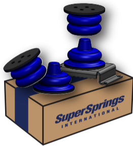
A SUMOSPRINGS FRONT SSF-170-40-2