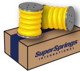
B SUMOSPRINGS REAR SSR-187-54-1